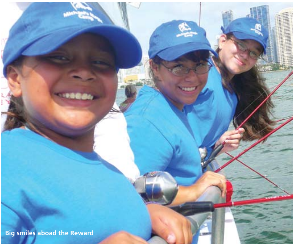
Big smiles aboard the Reward