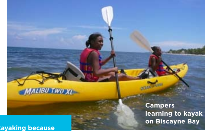
Campers learning to kayak on Biscayne Bay