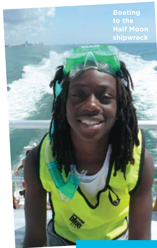
Boating to the Half Moon shipwreck