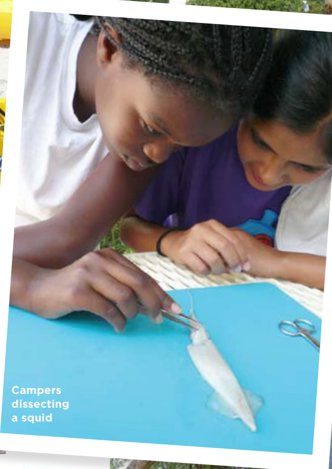
Campers dissecting a squid