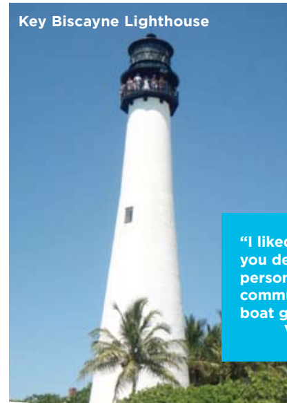
Key Biscayne Lighthouse