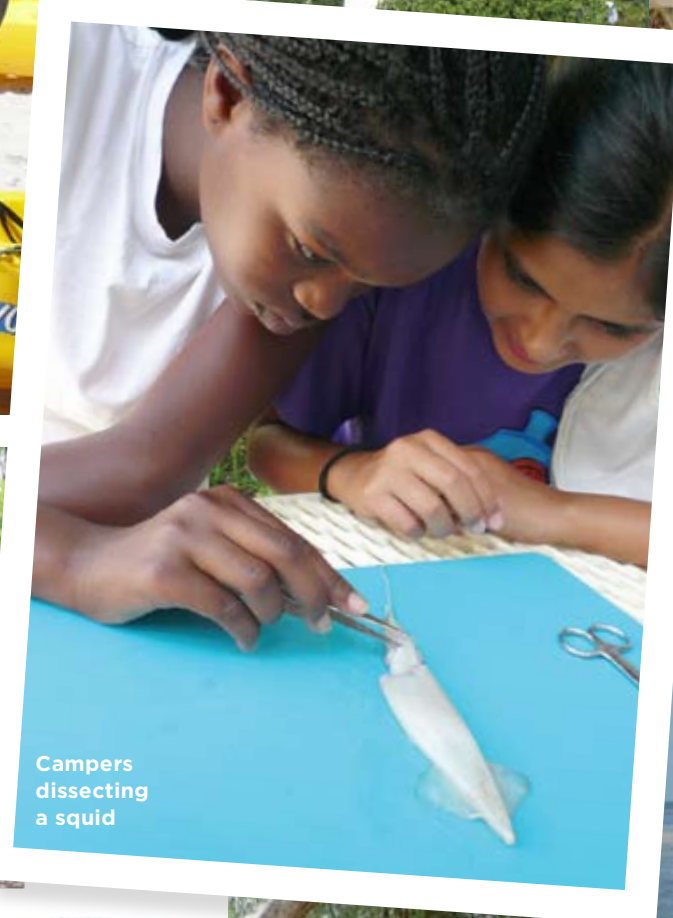
Campers dissecting a squid