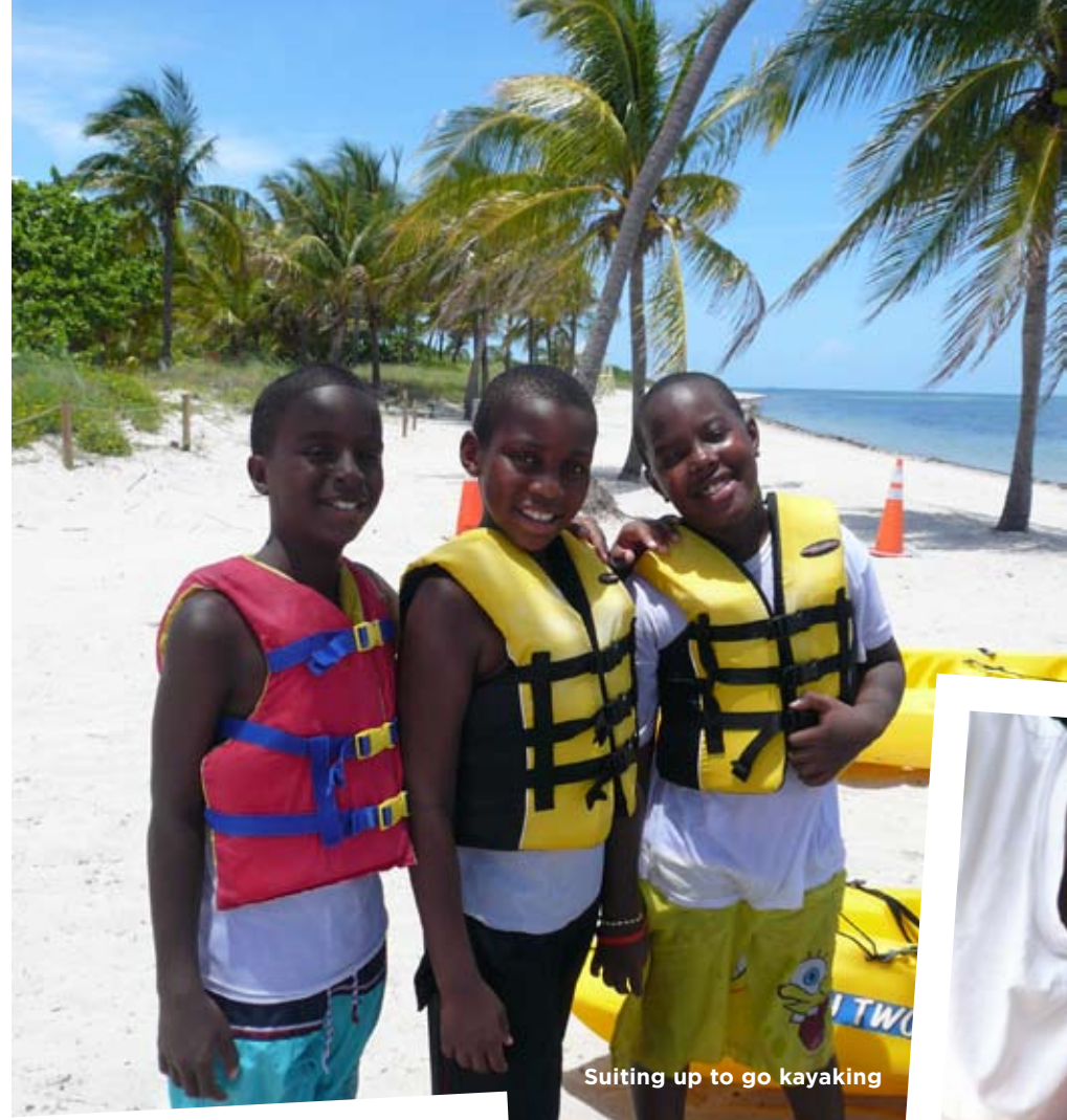
Suiting up to go kayaking