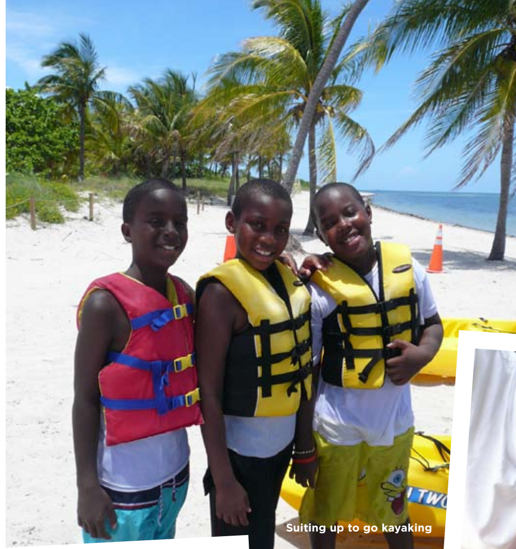
Suiting up to go kayaking