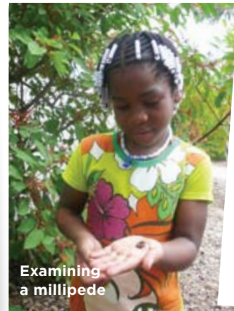
Examining a millipede