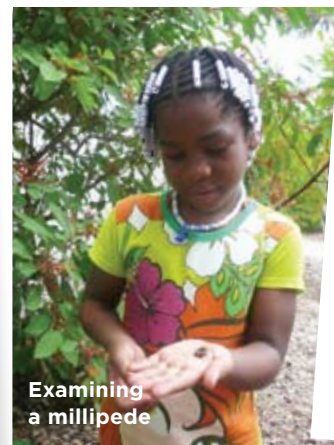
Examining a millipede