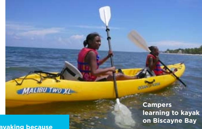
Campers learning to kayak on Biscayne Bay